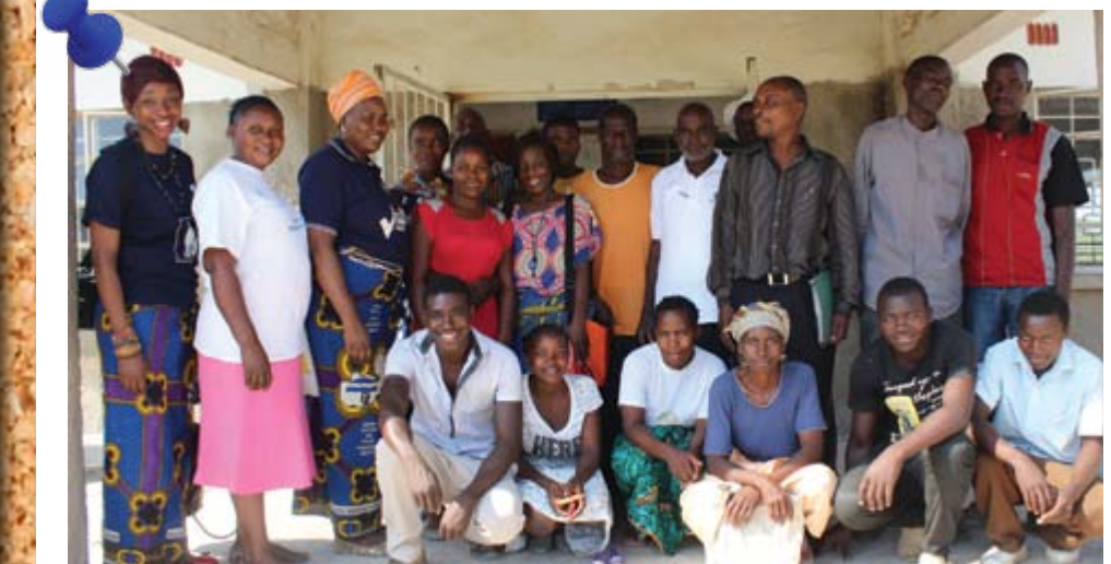
Monitoring of the end early marriages project at Kalwelwe Resettlement in Chisamba - MEC