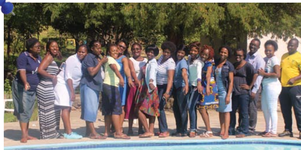
NGOCC staff member at the close of planning in Siavonga.