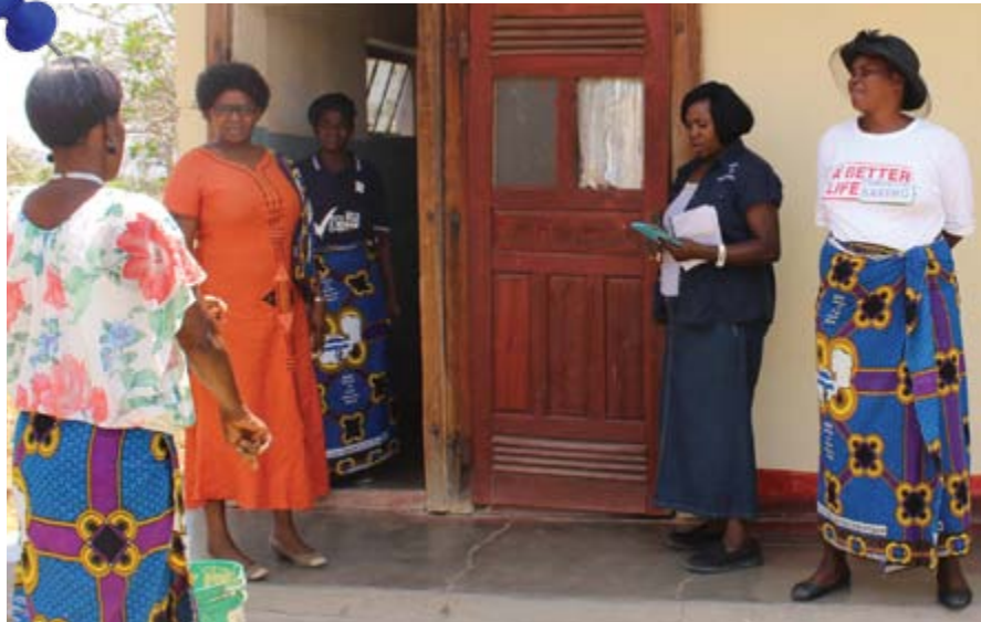
Monitoring visit of the guest house project implemented by Chama Development Women Association