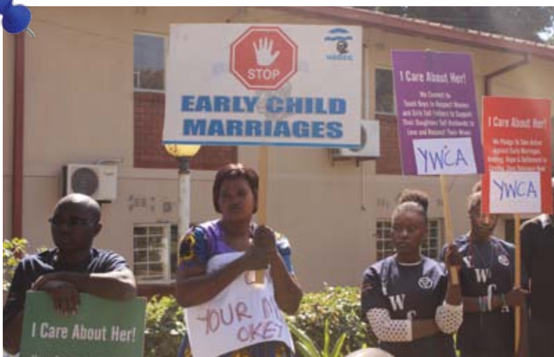
various messages against gender based violence