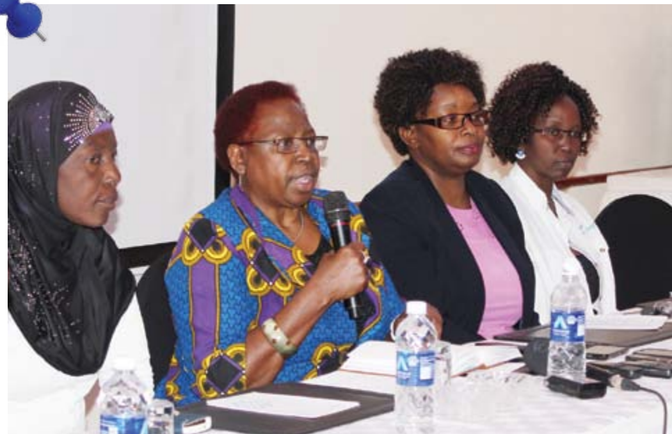
Pre-elections Press Conference on 10th August at Pamodzi Hotel