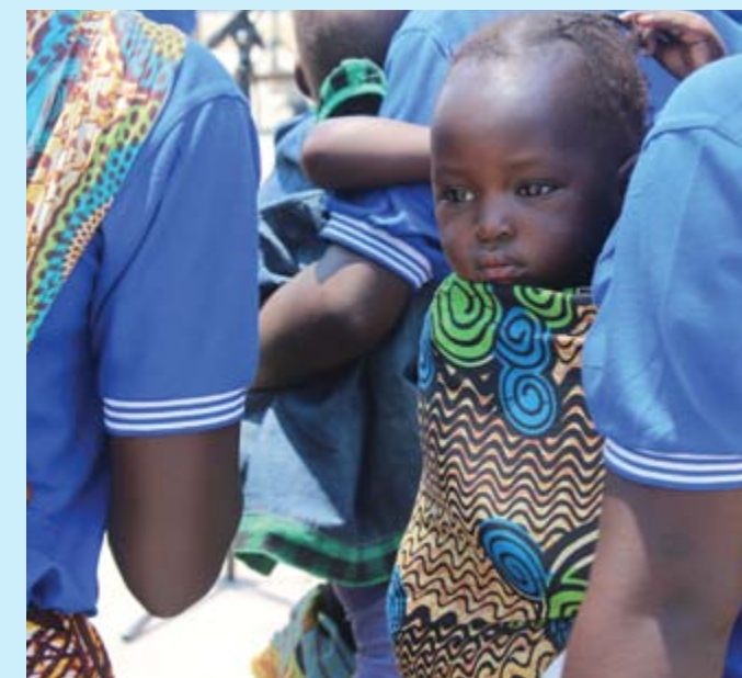
Prevention of child mortality rate is key

For over the years women in Malambanyama and