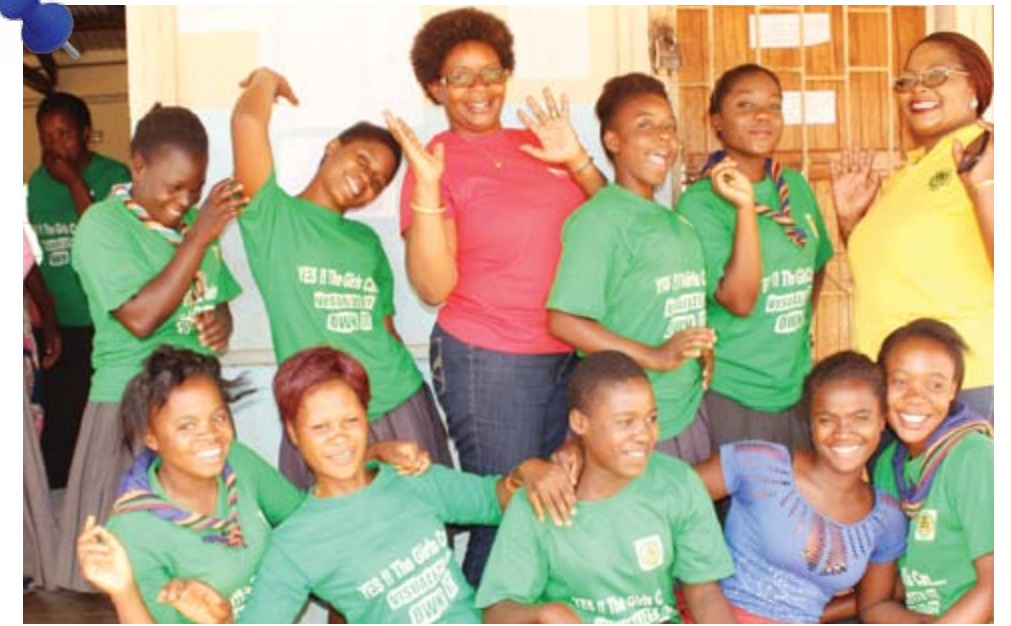
NGOCC Executive Director with the Girl Guides Peer Educators at Feni